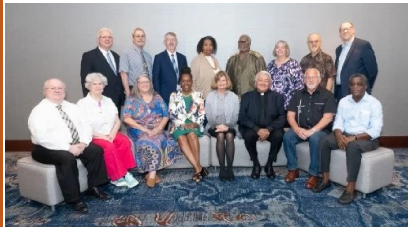
In this photo are all the clergy members retiring July 1, 2025. This photo was taken at the annual conference. At the annual conference they honored and celebrated these clergy members for serving a combined total of 604 years.